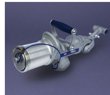
Mining and rail 1000 lpm (264 gpm)