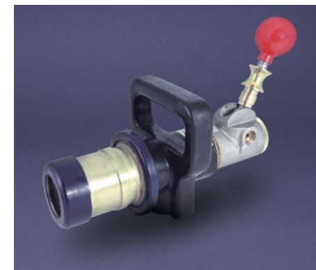
Mining underground 300 lpm (79 gpm)