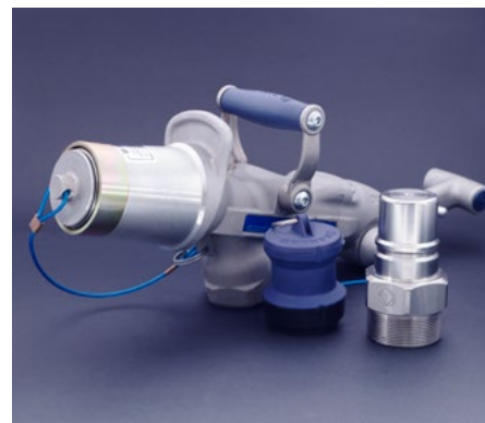
Mining 800 lpm (211 gpm) cold temperature model available

Our high speed refuelling hardware includes receivers, vents, loading arms, holsters, swivels, break-away valves and more. Each component has been engineered with an optimised fluid path and contamination-prevention features.